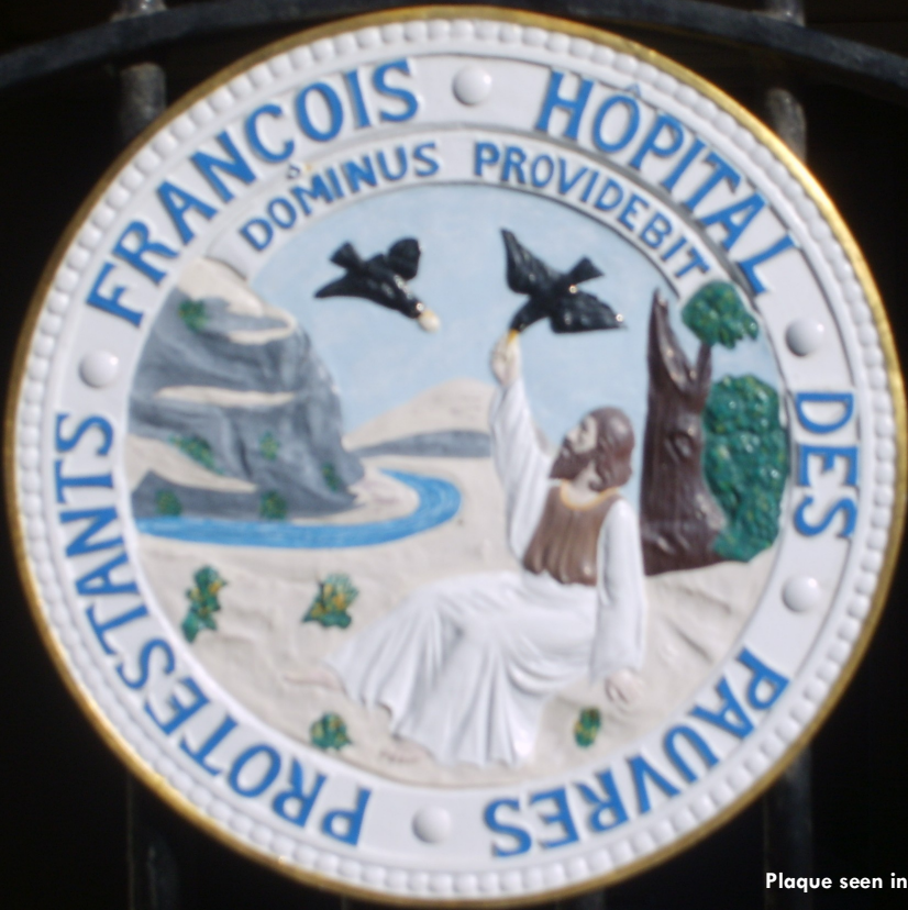
Plaque seen in Rochester