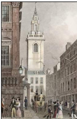
St Stephen, Walbrook—church of the ejected minister Thomas Watson

principle of a supper and in keeping with the idolatry of the mass whereby the bread and wine were worshipped as the transubstantiated body and blood of our Saviour. When the Corporation Act of 1661, which precluded Nonconformists from holding public office, was followed by the Act of Uniformity in 1662 things reached a head. Those who refused to take the oath not "to endeavour any